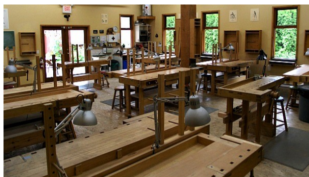
A glimpse at the Benchroom at IPSFC.

tion to the craft that is built on curiosity, feelings, and a reverence for the material. The work of the hand, the eye, and the heart -- where sensitivity and intimacy are encouraged, not suppressed.