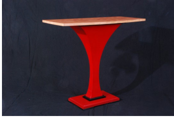
Mendocino Coast Furniture Maker mem- ber Les Cizik's Bordello .