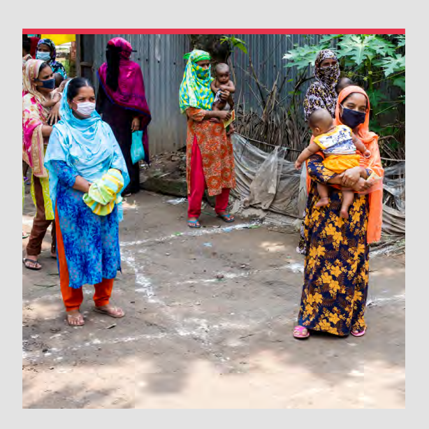
Caregivers maintain physical distance whilst waiting for routine immunization services in Bangladesh. Reaching all under-protected and unprotected children with vaccines is a priority of IA2030.

aim to respond to stagnation in immunization coverage, which left 17% of the world's children consistently under-protected or unprotected in 2020. COVID-19 exacerbated this gap, leaving 3.7 million more children under-vaccinated or unvaccinated in 2020, compared to 2019 (6). Concerted, collaborative efforts are needed now, and in the years ahead, to minimize the negative impacts of the pandemic on overall childhood vaccination.