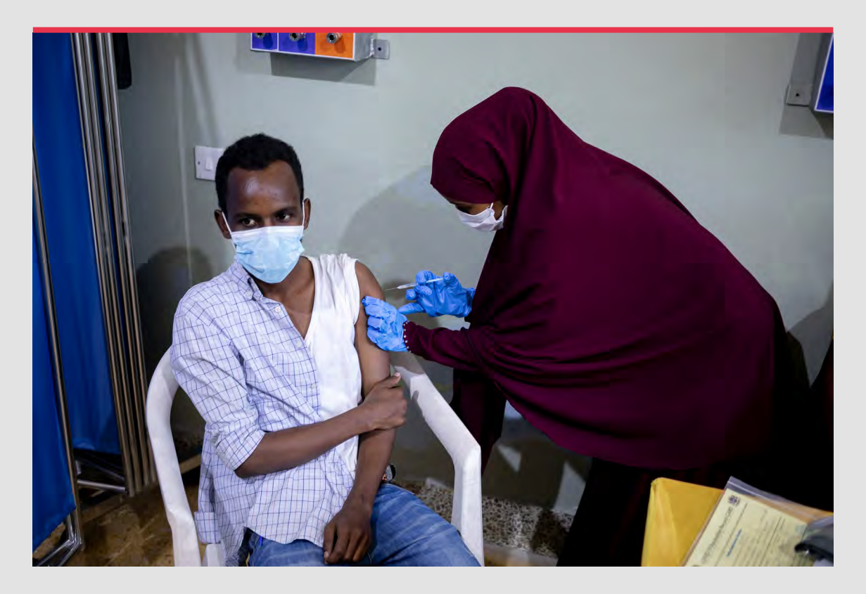
In addition to providing broad logistics and planning support for the COVID-19 vaccine roll-out, polio staff in Somalia helped to select COVID-19 vaccinators to ensure that all candidates had the appropriate qualifications and experience.