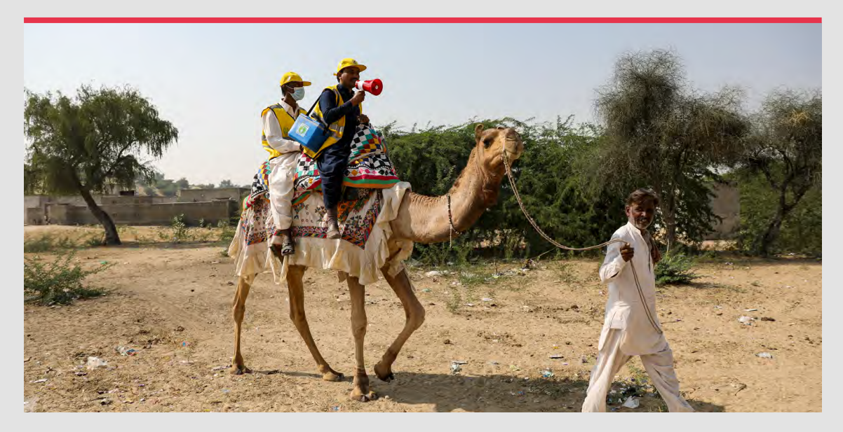
Polio vaccinators travel on camel during the November 2021 integrated measles-rubella and polio campaign in Pakistan. Close collaboration between the polio and immunization programmes helped to reach over 90 million children.

Integration is also an essential step towards the long-term, sustainable transition of polio functions to other health priorities and national health systems. By aligning its priorities with key global vaccine and immunization strategies, including the Immunization Agenda 2030 and the 2021–2025 strategy of Gavi, the Vaccine Alliance, the Global Polio Eradication Initiative recognizes the broader role that polio workers play in identifying and reaching zero-dose communities, as well as in disease surveillance and other operational areas. Integration offers a way to both improve immunization outcomes now, and lay the groundwork for polio staff to contribute their skills differently in future.