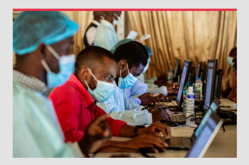
In Angola, polio staff contributed to COVID-19 vaccination by registering and training vaccination teams, supporting vaccine logistics and assisting with the organization of COVID-19 vaccination sites.

"The fourth area is to do with outbreak detection and response – for polio or other diseases, including for instance dengue fever. We really train and help the health system to detect and respond to emergencies. There is no outbreak response that is done in the absence of the polio team. We are everywhere."