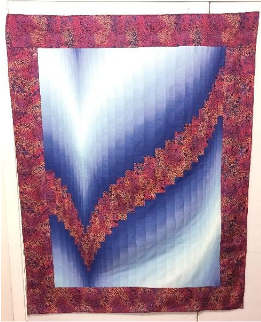
OMBRE BARGELLO (light -dark-light)