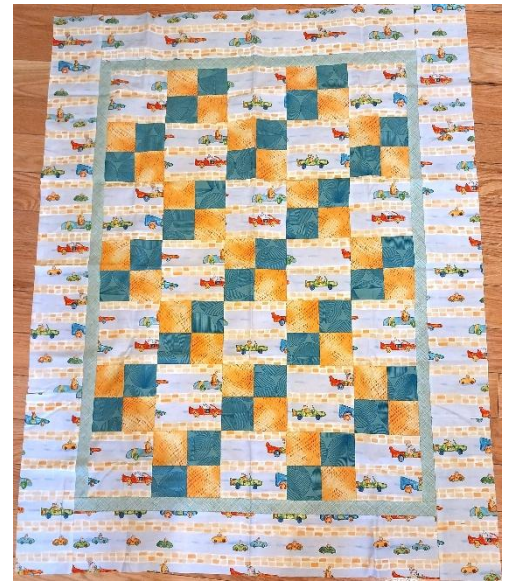
Warm Welcome Quilt