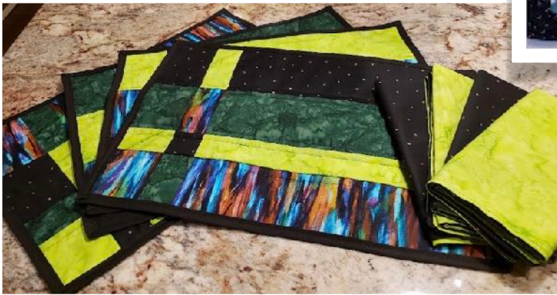
Placemat set for my Uncle and Aunt who have cabbage dishes..