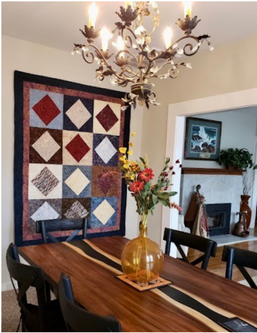
Learning square in a square..