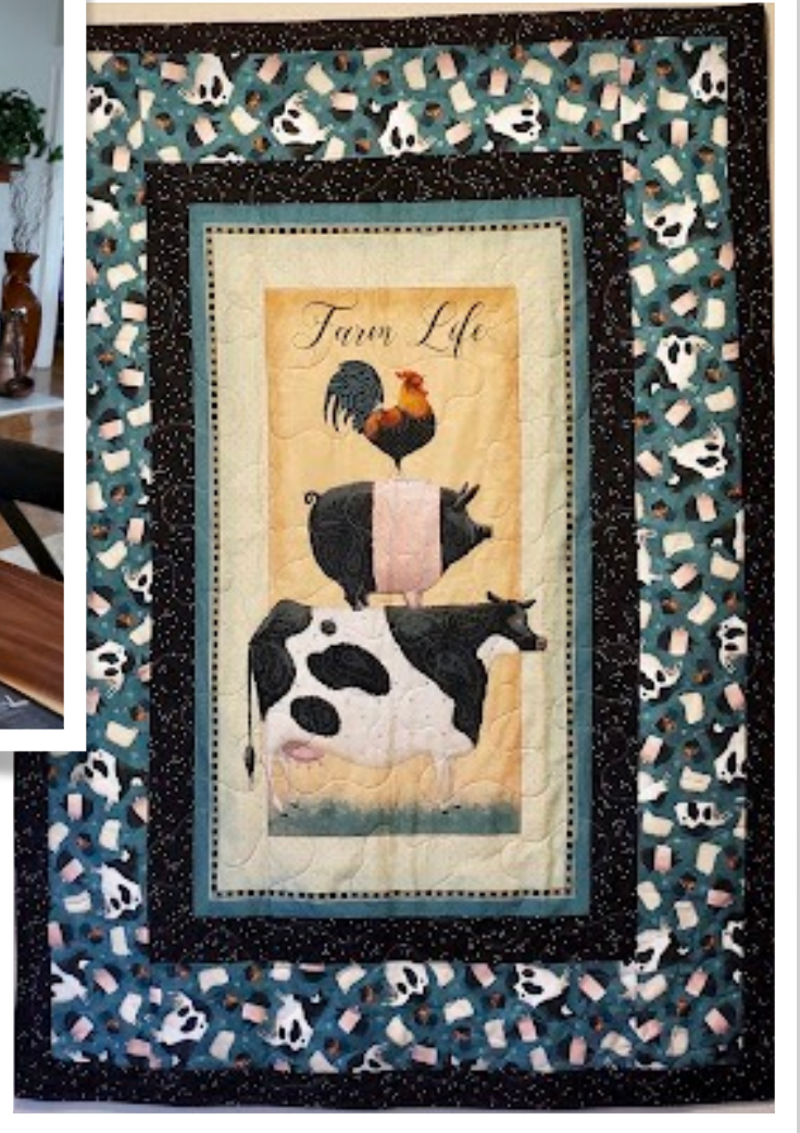
Normally I'm not crazy about panels, but couldn't resist this one!