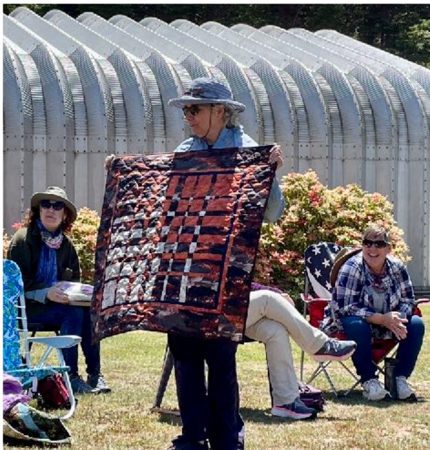
Sandy B Texture quilt