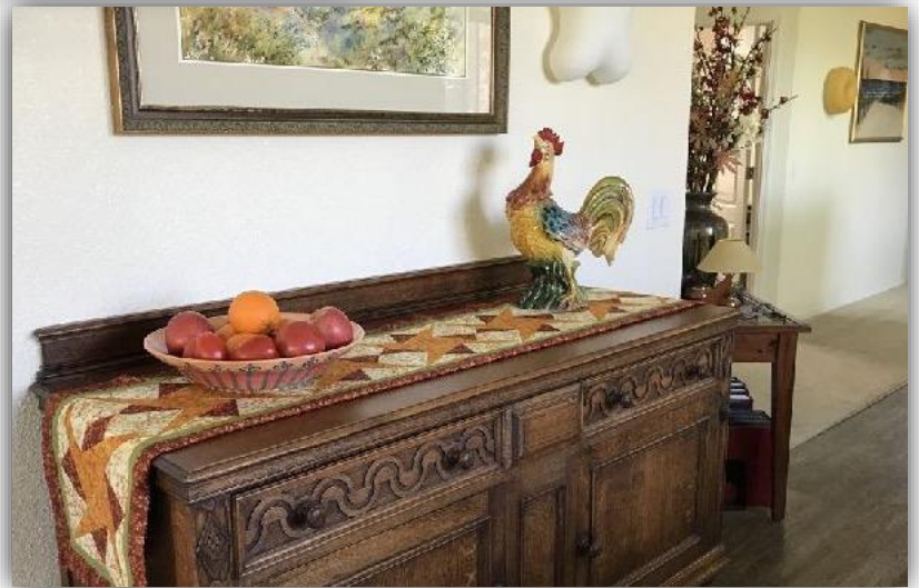
Table runner — autumn fabric from Sew 'n Sew a couple years ago. Finally decided what to do with it; designed in EQ8 and happy to learn the program produces paper piecing patterns. This will be my first attempt at free motion machine quilting after some practice.