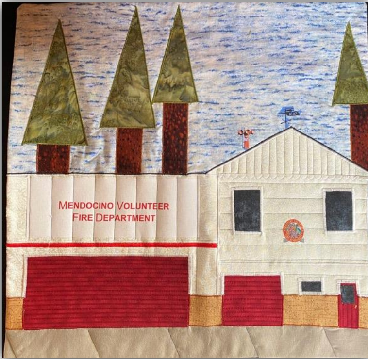
This is my iconic building quilt, finished at last!