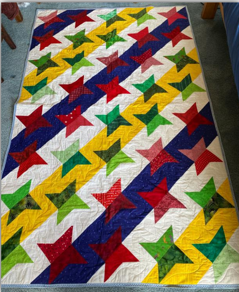
I made this from some squares I won one month. This was a BOM for July several years ago, so all of our blocks were red, white and blue. I decided I wanted more colors so I made all of the green and yellow squares and put it all together.