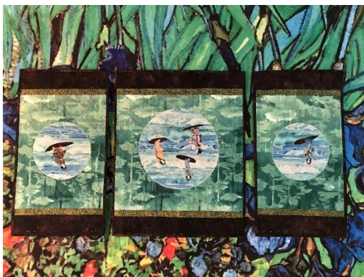
Center 18"x22". Side pieces 12"@x22"

I completed a set of small quilts featuring surfing geisha.