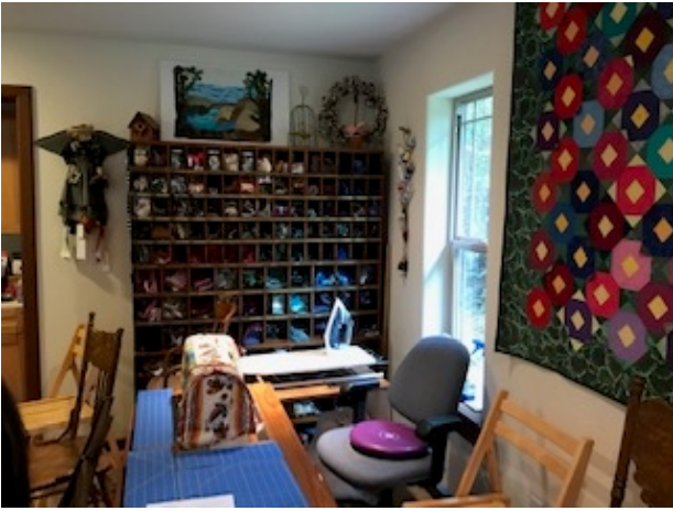
Becky's Quilt Studio