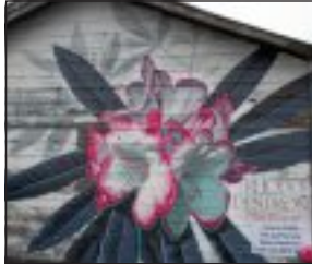
The Pink Lady Rhododendron now graces Redwood Avenue in Fort Bragg.

The first Alleyways Mural unveiling was held Friday evening, May 25 in Fort Bragg. The festivities were moved into the Golden West Saloon due to rain. A lively crowd of over 50 supporters, the band Hot Club of Comptche and dignitaries from Flockworks and the mural's sponsor, Mendocino Coast Botanical Gardens, were on hand to celebrate the new mural which could be seen